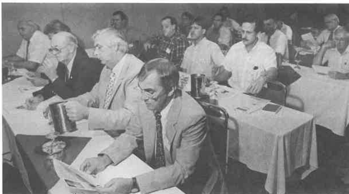
MORE THAN 50 REPRESENTATIVES from the ACT Foundation's 23 local unions attended ACT's first Leadership Conference held in Charleston recently. The representatives got an insight on what the ACT has been doing and gave directions on what it should work on.