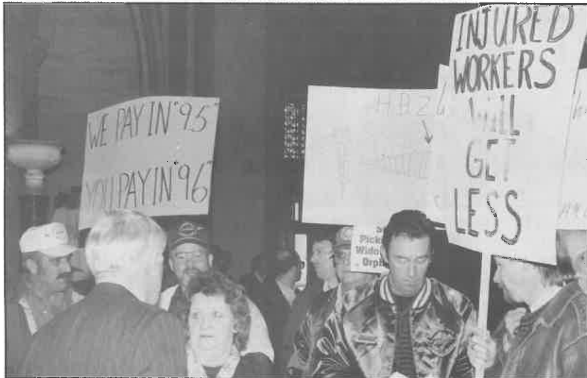
PROTESTING changes in West Virginia's Workers Compensation program as proposed by Gov. Caperton and legislative leaders are workers from across the state at a Capitol rally.