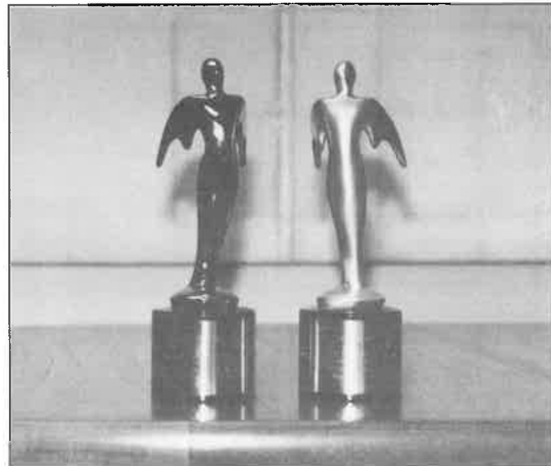
WINNING SILVER AND BRONZE for ACT TV commercials wasn't easy against competitors like ESPN, Walt Disney, McDonald's, Kroger and Bell Atlantic.

ACT hired the Charleston based firm, Image Associates, to produce the commercials.