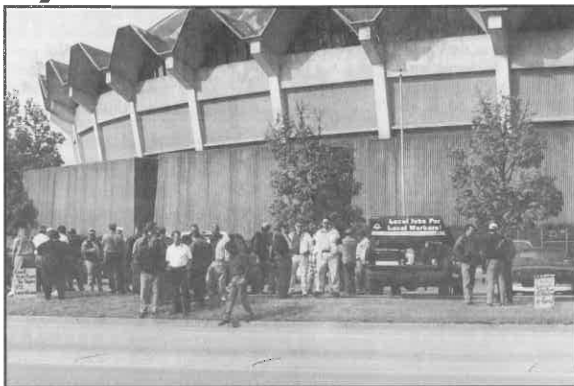
PICTURED OUTSIDE WEST VIRGINIA UNIVERSITY'S (WVU) COLISEUM are union members, concerned citizens and members of the WVU student body. They are protesting the use of out-of-state workers for the asbestos removal.