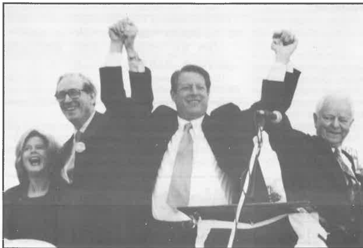
Gore greets supporters, three days before the election, with U.S. Senators Robert C. Byrd and Jay Rockefeller by his side. Gore told supporters at the recent campaign rally in Huntington that he will always defend American workers' right to organize.