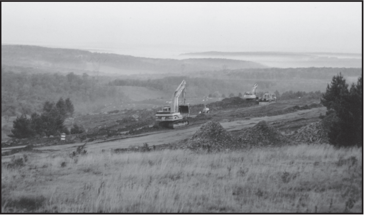
SITE PREP WORK on the Mount Storm wind farm in Grant County is underway using local subcontractor ALL Construction, based in Grant County, and members of the Operating Engineers and Laborers.