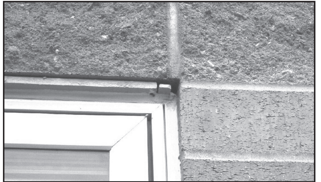
THIS PICTURE SHOWS a lentils that is too short. It was installed by Lang Masonry and is just one of many examples of shoddy work found and documented at the Frontier High School.

"That can only happen when quality contractors hire quality people to build quality buildings."