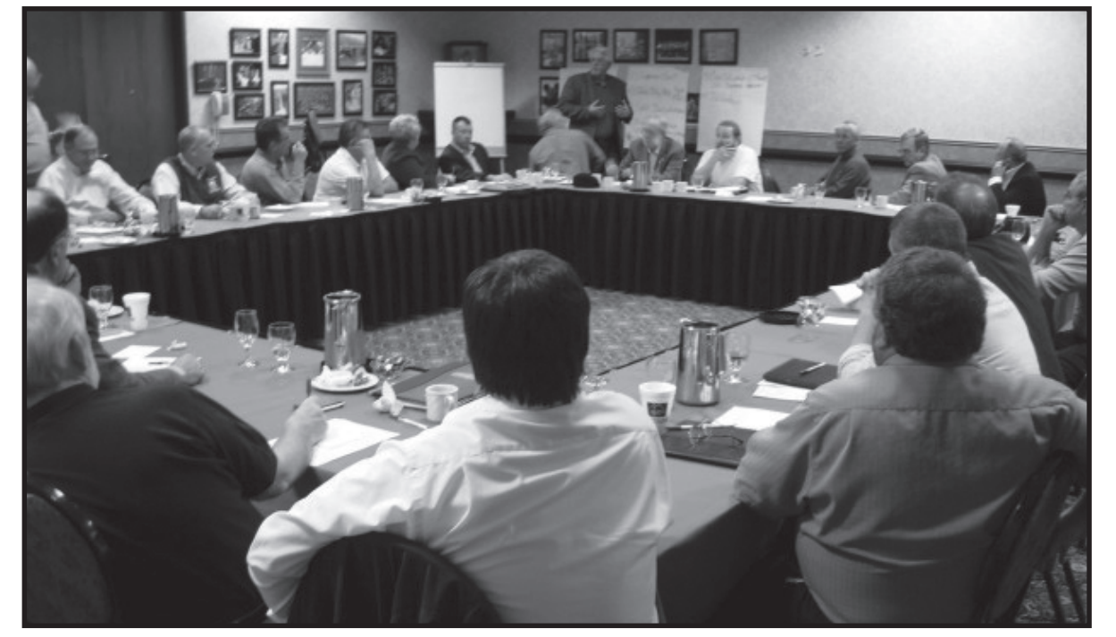
PLANNING FOR THE future, members of the West Virginia State Building Trades meet and discuss common problems and identify possible solutions.

The purpose of the planning meeting was to map out short and long term goals for future efforts by the Trades.